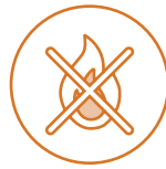
In Drum Extinguish