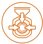
Sub-Atmospheric Combustion Chamber