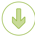
Low Energy Consumption