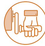
Safety Manual Crank