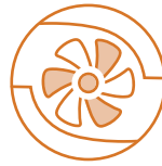
Blower Speed Control