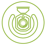
Pollution Free Ambient